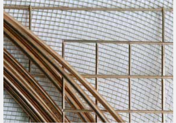
Seawire® - aquaculture wire