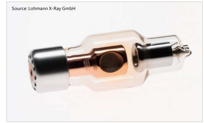
X-ray tube