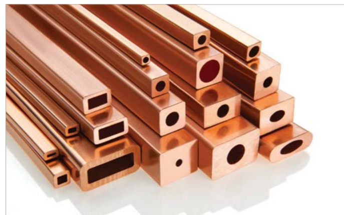
Luvata hollow conductors, OF-OK® and OFE-OK®