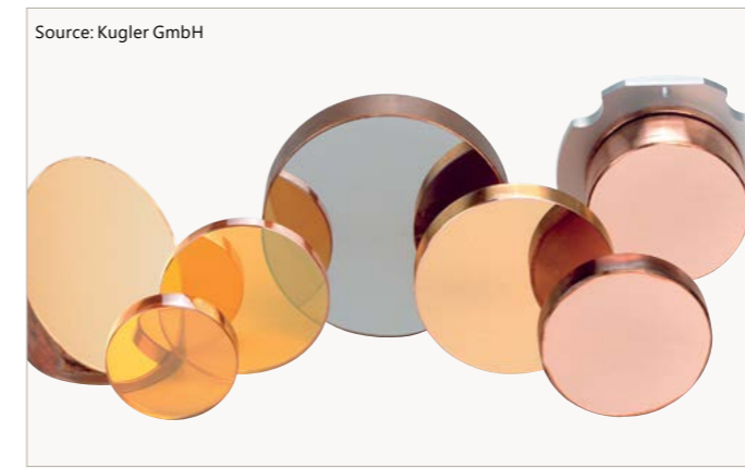
Laser mirrors

On request, Luvata also provides copper materials having RRR within a specific range and alloyed copper grades with very low RRR value.