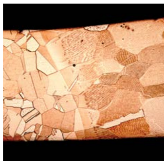
Hydrogen embrittlement in TIG welded, ETP (left) versus Luvata's TIG welding seam in oxygen-free OF-OK® copper (right)