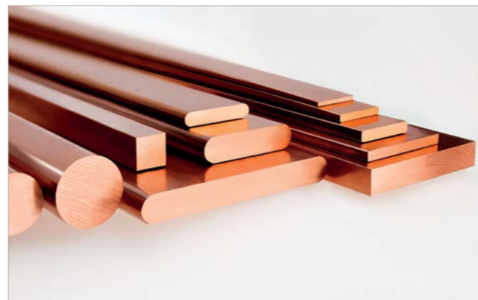
Luvata rods, bars and busbars, OF-OK® and OFE-OK®